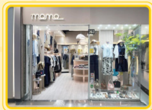
▲ Momo Shop 263