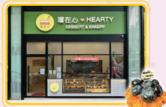
▲ Hearty Dessert and Bakery G04C - 05