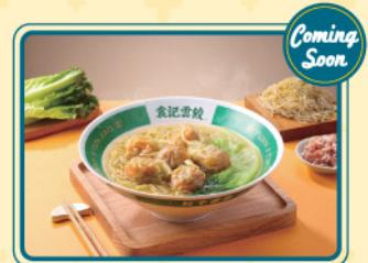
▲ Yuan Ji Yun Dumpling Shop 205 - 206