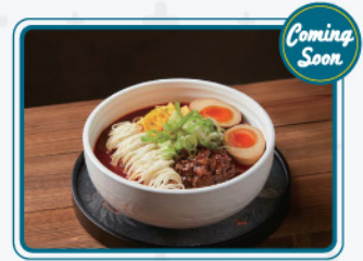
▲ Hefu Noodles Shop 2043 - 2044