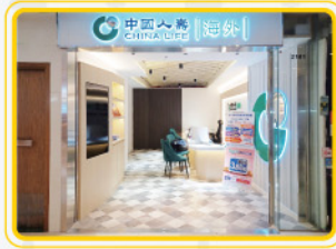
▲ China Life Shop 2101