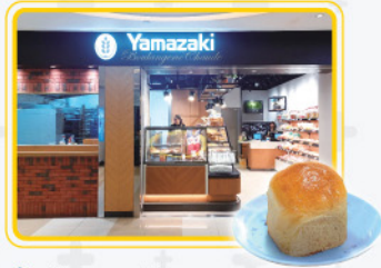
▲ Yamazaki Shop 2045 - 2046