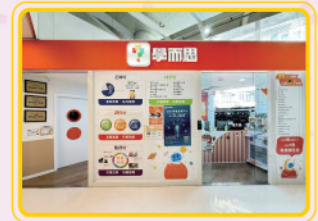
▲ Think Academy Kids Intelligence Development Centre 109B